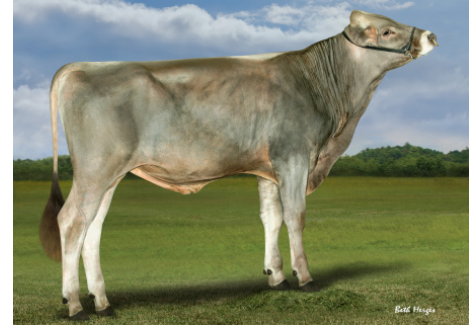
La Rainbow Sweet Salsa ETV *TM