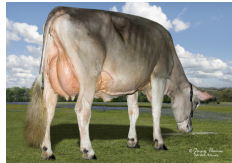
La Rainbow Cadence Sweet Silk 'E 90 E 91 MS' 1-09 365d 2x 26,240 5.0 1,321 3.9 1,025 3-07 365d 2x 26,896 5.3 1,425 3.5 930