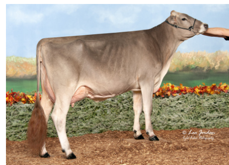
Kruses Salsa Bonnie-ETV 1st Place Yearling in Milk Southwest National 2023 3rd Place Yearling in Milk World Dairy Expo 2023 1st Produce of Dam Southwest National 2023

Sire: Kulp-Terra Lucky Carl ET Dam: La Rainbow Sweet Silk ETV 'E91 E91MS' 3-07 365d 2x 26,896 5.3 1,425 3.5 930