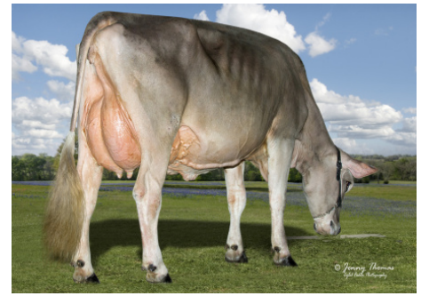
La Rainbow Cadence Sweet Silk 'E 90 E 91 MS' 1-09 365d 2x 26,240 5.0 1,321 3.9 1,025 3-07 365d 2x 26,896 5.3 1,425 3.5 930

Sire: Kulp-Terra Lucky Carl ET Dam: La Rainbow Sweet Silk ETV 'E91 E91MS' 3-07 365d 2x 26,896 5.3 1,425 3.5 930