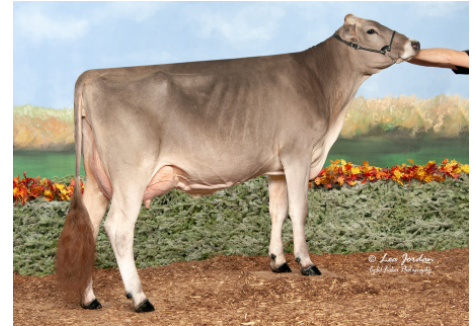
Kruses Salsa Bonnie-ETV 1st Place Yearling in Milk Southwest National 2023 3rd Place Yearling in Milk World Dairy Expo 2023 1st Produce of Dam Southwest National 2023