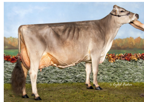
Brown Heaven Glenn Fantasy 'EX 97 EX 97 MS' Grand Champion World Dairy Expo 2015 & 2016 All American 2012, 2014, 2015 & 2016 All Canadian 2012, 2013 & 2014 Grand Champion Royal Winter Fair 2013 Reserve All American 2013 Reserve Grand Champion World Dairy Expo 2014

01/09 365d 2X 29,121 4.3 1,257 3.8 1,113 04/10 365d 2X 35,470 4.9 1,753 3.6 1,276 Nominated All American 2015