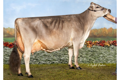
Brown Heaven Glenn Fantasy 'EX 97 EX 97 MS' Grand Champion World Dairy Expo 2015 & 2016 All American 2012, 2014, 2015 & 2016 All Canadian 2012, 2013 & 2014 Grand Champion Royal Winter Fair 2013 Reserve All American 2013 Reserve Grand Champion World Dairy Expo 2014

01/09 365d 2X 29,121 4.3 1,257 3.8 1,113 04/10 365d 2X 35,470 4.9 1,753 3.6 1,276 Nominated All American 2015