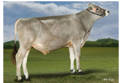
Brown Heaven Calvin FIRST CHOICE ET

2-04 365d 2x 23,104 4.2 974 3.7 866 4-00 365d 2x 30,091 3.8 1,151 3.6 1,096 5-11 365d 2x 35,556 4.7 1,658 3.4 1,208 Lifetime: 1,748d 128,519m 5,710f 4,770p