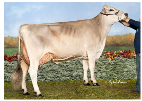
Brown Heaven J Fancy 'EX 90 EX 93 MS'

01/09 365d 2X 29,121 4.3 1,257 3.8 1,113 04/10 365d 2X 35,470 4.9 1,753 3.6 1,276 Nominated All American 2015