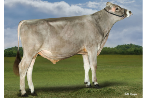
54BS602 Brown Heaven Calvin First Choice ET