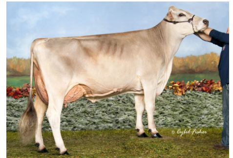
Brown Heaven J Fancy 'EX 90 EX 93 MS' Dam of 54BS602 First Choice