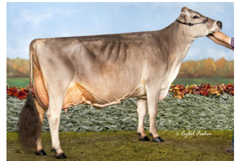
Brown Heaven Glenn Fantasy 'EX 97 EX 97 MS' Maternal Granddam of 54BS602 First Choice