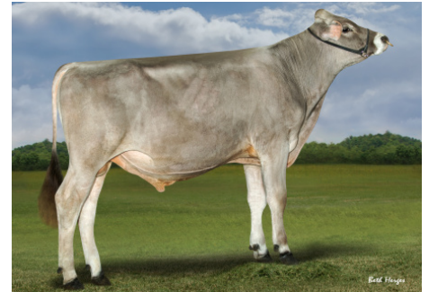
54BS602 Brown Heaven Calvin First Choice ET