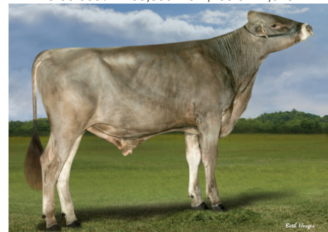
54BS603 Kulp-Terra Silver Coin