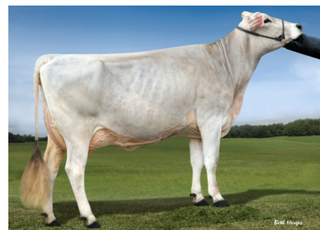
Dam: Voelkers Brook Cara 'E 92 E 90 MS' 2-06 305d 2x 23,300 4.4 1,023 3.5 812 6-05 305d 2x 39,880 4.5 1,798 3.4 1,345

Sire: La Rainbow Sweet Silver ET *TM Dam: Kulp-Terra CASANDRA ET "V 87 E 90 MS" 2-09 365D 2X 24,753 4.2 1,069 3.6 896 MGS: Kiba Anibal Fact ET MGD: Voelkers Brook Cara "E 91 E 90 MS" 6-05 305D 2X 39,880 4.5 1,798 3.4 1,345