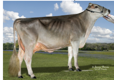
MGD: La Rainbow Sweet Silk 'E 91 E 91 MS'

1-09 340d 2x 24,567 5.1 1,247 3.9 953 3-07 365d 2x 26,896 5.3 1,425 3.5 930 R.I.P. 5-00 107d 2x 8,277 4.4 363 3.4 277