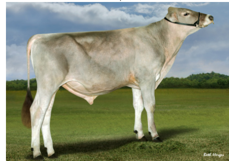
54BS604 La Rainbow Sweet Spark *NP ETV *TM

1-10 306d 2x 18,990 4.4 833 3.3 630 R.I.P 2-09 116d 2x 8,633 3.9 333 3.2 276