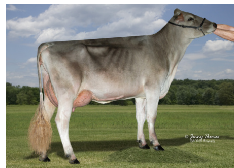
Dam: La Rainbow Daredevil Sweet Siesta ET 'E 90 E 90 MS'

1-10 306d 2x 18,990 4.4 833 3.3 630 R.I.P 2-09 116d 2x 8,633 3.9 333 3.2 276