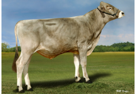
54BS608 Trout Hilltop Jordy ETV