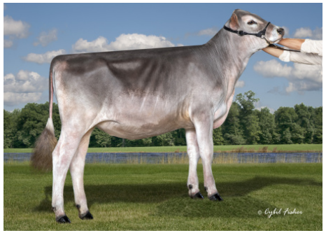
Hilltop Acres Jordy Dane NP 1st place summer yearling Mid-West Regional Brown Swiss Show 2023 Owned by Perry Brook Brown Swiss, Vermont

Sire: Victor-ET P Dam: Trout Run Driver Jan P 'E 90 E 91 MS' 8-07 365d 3x 34,639 4.5 1,574 3.8 1,313 LIFETIME: 2,729D 255,200M 12,491F 9,765P MGS: Hilltop Acres H Driver-T TM MGD: Trout Run Jill P 'V 85 V 86 MS' 4-00 305D 2X 19,210 4.8 922 3.3 631