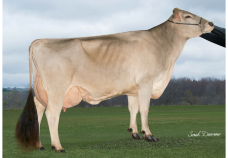
Jordy's Dam: Trout Run Driver Jan P 2nd Lactation