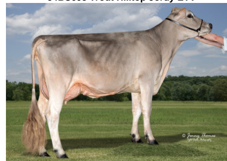
LA RAINBOW SWEET SORAYA ETV 1ST JR TWO YEAR OLD, OHIO STATE FAIR, 2024 OWNED BY: LA RAINBOW FARMS, OHIO