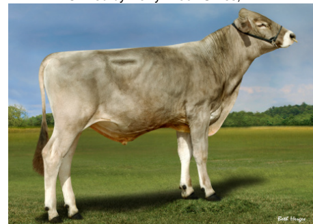
54BS608 Trout Hilltop Jordy ETV