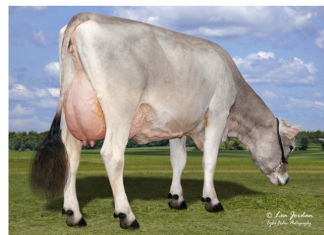
Perry Brook Jordy Lulu Lemon ETV MATERNAL SISTER TO 54BS618 CRAZY HORSE, 54BS35 CRAZY MAN 54BS636 INTENT & 54BS620 ELAN Owned by Perry Brook Swiss, VT