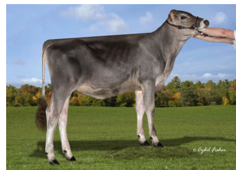
Ledge N Tree TO Beasweet 3rd place Spring calf Northeast National Show 2023 Owned by Alivia Pickard, Vermont