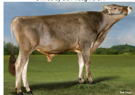
Jennings Gap Time Out