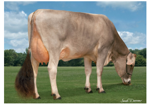
Dam: HF LC Chasing Dreams-ET VG-87-2YR Bred and Owned by Hendel Farms, MN