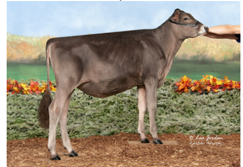
Hilltop Acres D Tiana ETV 3rd Place Spring Calf World Dairy Expo 2023 1st Place Spring Calf Iowa State Fair 2023 Owned by Hilltop Acres, IA