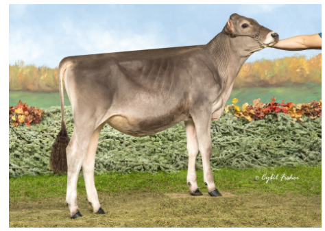
Brown Heaven Design Freida 1st place Spring Calf World Dairy Expo 2023 Owned by Brown Heaven Farm, Quebec, Canada