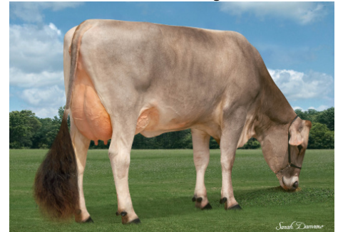
Dam: HF LC Chasing Dreams-ET VG-87-2YR Bred and Owned by Hendel Farms, MN