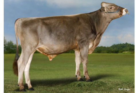
54BS611 HF Design ET