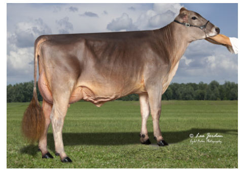
VB Design Pitch Perfect NOMINTAED ALL AMERICAN SR. 2 YEAR OLD 2025 1ST SR. 2 YEAR OLD WI STATE SHOW 2025 Owned by Voegeli Farms, Wisconsin