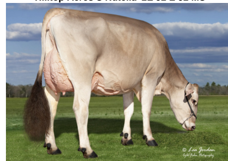
Hilltop Acres Nash Iggy