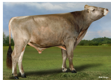
54BS619 Hilltop Acres Nashville-ET