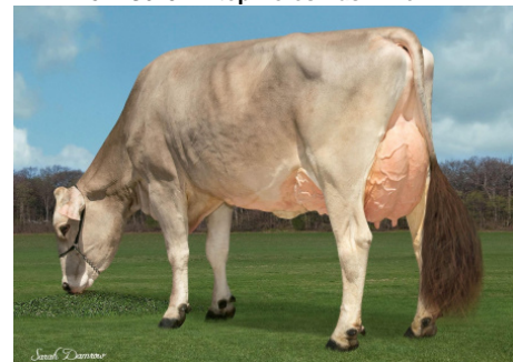
Hilltop Acres S Nutella '2E 92 E 92 MS' 3RD LACT. DAM OF 54BS619 NASHVILLE