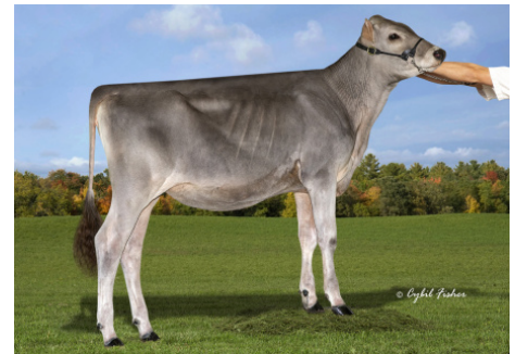
FULL SISTER: PERRY BROOK PACTOLE LULU ETV 1ST PLACE SPRING CALF NORTHEAST NATIONAL SHOW 2022 COMPONENT MERIT AWARD WINNER WORLD DAIRY EXPO 2022