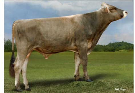
54BS620 Perry Brook Pact Elan-ETV