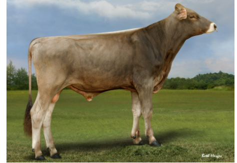
54BS622 HF Dublin-ET