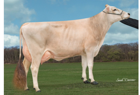
MGD: Hilltop Acres Cad Paula 'V 87 V 88 MS'