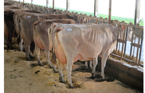
Dam: Hilltop Acres Princess ETV 'E 91 E 91 MS'