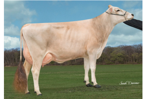
MGD: Hilltop Acres Cad Paula 'V 87 V 88 MS'