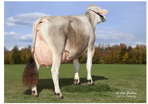
Hilltop Acres Princess ETV 'E 91 E 91 MS' DAM OF 54BS625 PRINCE

Sire: Pactole Dam: Hilltop Acres Princess ETV 'E 91 E 91MS' 1-11 305d 3x 24,510 4.8 1,169 3.6 877 2-11 365d 3x 44,160 5.7 2,525 3.8 1,696 MGS: Hilltop Acres D Kickstart ET MGD: Hilltop Acres Cad Paula 'VG 87 VG 87 MS' 1-11 365d 3x 32,990 4.6 1,522 3.8 1,257 7-3 365d 3x 38,860 4.8 1,878 3.7 1,433