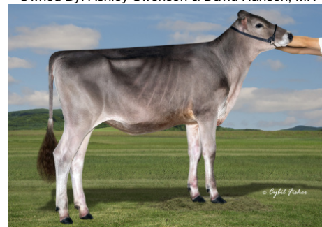
PEACHKIST PRINCE BRISTOW Owned by Peach Kist Farm, Maryland

NEW GENERATION GENETICS www.brownswiss.com (920) 568-0554 E-mail: info@brownswiss.com