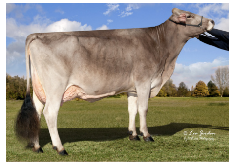
Hilltop Acres Kingsley Tammie 'E 90 E 91 MS' Dam of 54BS628 Top Notch