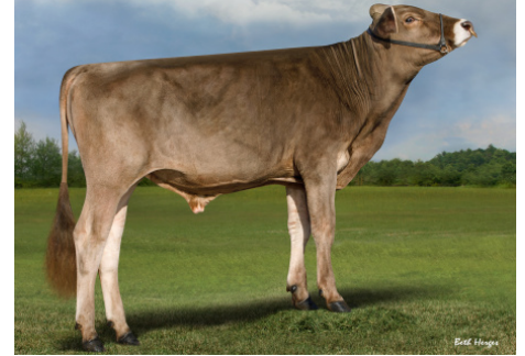
54BS628 Hilltop Acres Top Notch ET