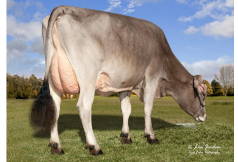
Hilltop Acres Kingsley Tammie 'E 90 E 91 MS' Dam of 54BS628 Top Notch