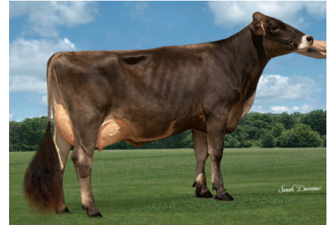
MGD: Hilltop Acres DB Tabby ETV 2nd Lactation 'E 91 E 91 MS'