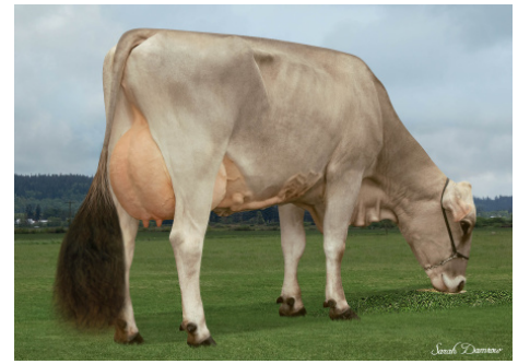
Santiam Silver Sweetness *NP 'V 85 V 85 MS' DAM OF 54BS629 SNIPER *PP 2ND LACTATION

Genomic Gems JORDY * NP X SILVER X JAY *P