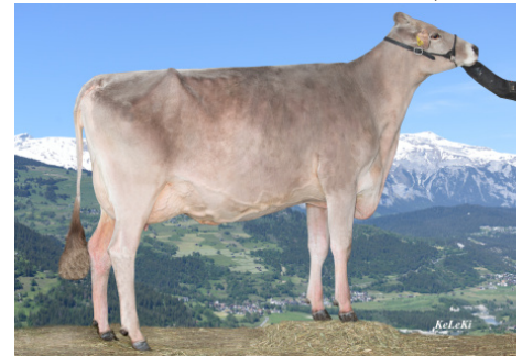
Jolahofs Dreamer Calida ET 'V 87 V 88 MS' DAM OF 54BS631 CAM