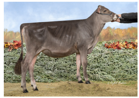
OPSAL-JH CAME TO PLAY DAUGHTER OF CAM OWNED BY: JOSEPH & HAYLEIGH OPSAL, WI