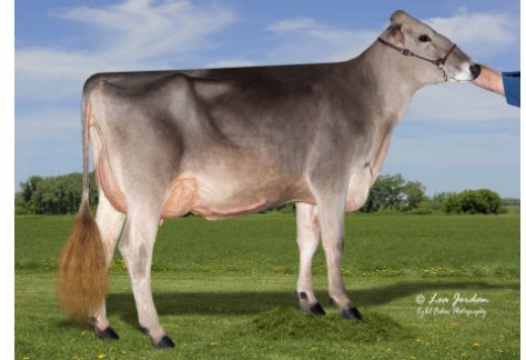
SG VB BINIAM CALLISE-ET VG-85 FULL SISTER TO CAM 1ST SR TWO YEAR OLD & HM INTERMEDIATE CHAMPION MIDWEST QUALITY SPRING SHOW, 2025 OWNED BY: VOEGELI FARMS & NGG, WI