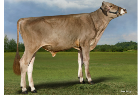
54BS631 SG HT Biniam Cam ET