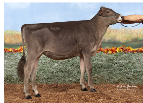
BRITTCOS WORLD CLASS WEAPON-ET Owned by Brittcos Farm, NC