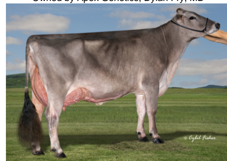
Hilltop Acres DB Whisper ETV '2E 92 E 92 MS' NOMINATED ALL AMERICAN 5 YR OLD 2025 DAM OF WORLD CLASS 3rd Lactation