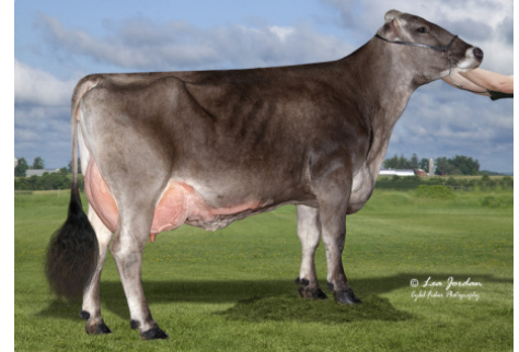
Perry Brook Bush Indian 'V 88 E 90 MS' Maternal Granddam of 54BS636 INTENT