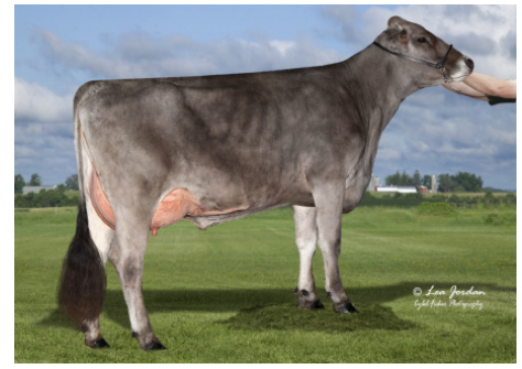
Perry Brook Lucky India 'V 87 V 87 MS' Dam of 54BS636 INTENT

Sire: Rastaroket Dam: Perry Brook Lucky India 'V 87 V 88 MS' 1-10 323d 3x 21,830 4.8 1,052 3.5 768 2-10 305d 3x 24,905 4.4 1,096 3.6 897 MGS: North Star Lucky Chance-ET MGD: Perry Brook Bush Indian 'V 88 E 90 MS' 4-2 345d 3x 25,040 4.5 1,138 3.7 923 5-4 365d 3x 21,970 4.4 967 3.8 836