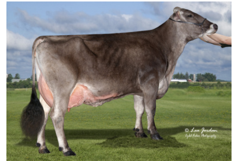
Perry Brook Bush Indian 'V 88 E 90 MS' Maternal Granddam of 54BS636 INTENT

Sire: Rastaroket Dam: Perry Brook Lucky India 'V 87 V 88 MS' 1-10 323d 3x 21,830 4.8 1,052 3.5 768 2-10 305d 3x 24,905 4.4 1,096 3.6 897 MGS: North Star Lucky Chance-ET MGD: Perry Brook Bush Indian 'V 88 E 90 MS' 4-2 345d 3x 25,040 4.5 1,138 3.7 923 5-4 365d 3x 21,970 4.4 967 3.8 836