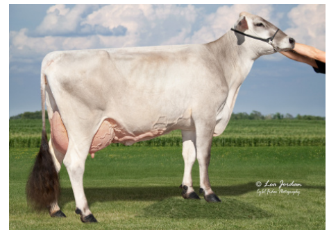
Perry Brook Lucky India 'V 87 V 87 MS' 2ND LACTATION DAM OF 54BS636 INTENT