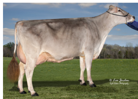
Cher-Mi Lover Varda 'E 91 E 91 MS' DAM OF 709BS11 VIRGIL *NP 2ND LACTATION