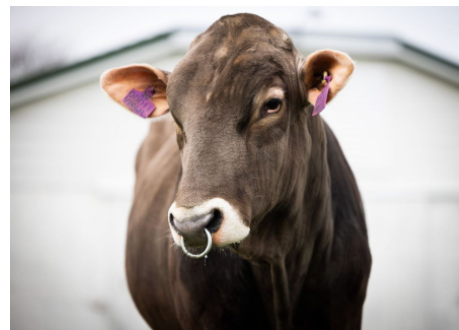
709BS11 VIRGIL *NP