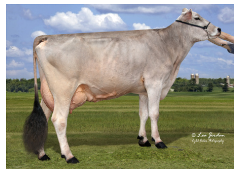
Perry Brook Pact Lulu ETV 'V 88 V 88 MS' DAM OF 709BS14 LUNAR

Sire: Sting *TM Dam: Perry Brook Pact Lulu ETV 'V 88 V 88 MS' 2-00 303d 3x 20,300 4.6 941 3.7 757 MGS: Pactole MGD: Perry Brook Lucky India 'V 87 V 88 MS' 1-10 323d 3x 21,830 4.8 1,052 3.5 768 2-10 365d 3x 30,440 4.5 1,365 3.6 1,107