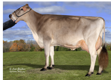
Hilltop Acres D Tinder ET 'V 85 V 86 MS' DAM OF 709BS18 TIKTOK

Sire: Hilltop Acres J Tesla ET Dam: Hilltop Acres D Tinder 'V 85 V 86 MS' 2-03 331d 3x 31,390 4.6 1,435 3.7 1,154 MGS: HF Design ET MGD: Hilltop Acres Sky Toyota ETV 'V 86 V 86 MS' 1-11 365d 3x 33,700 4.1 1,370 3.5 1,174