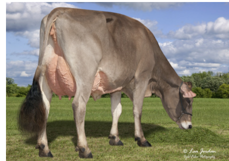
Hilltop Acres Sky Toyota ETV 'V 86 V 86 MS' MGDS OF 709BS18 TIKTOK