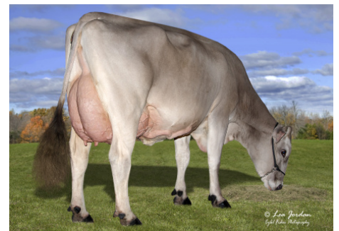
Red Brae Pactole Nicki ETV 'E 90 E 91 MS' DAM OF 709BS19 ROCKSTAR