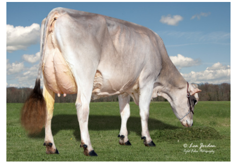
V B SECRET WEAPON TRULY 'E 90 E 90 MS' DAM OF 709BS2 FULL THROTTLE

Sire: COLLAPS Dam: V B Secret Weapon Truly 'E 90 E 90 MS' 2-00 202d 3x 11,920 4.1 487 3.5 418 MGS: Cutting Edge Secret Weapon MGD: V B HP Norwin Teanna ET '2E 90' LIFETIME: 1,373d 106,870m 4,833f 3,458p RESERVE ALL AMERICAN YEARLING IN MILK 2018