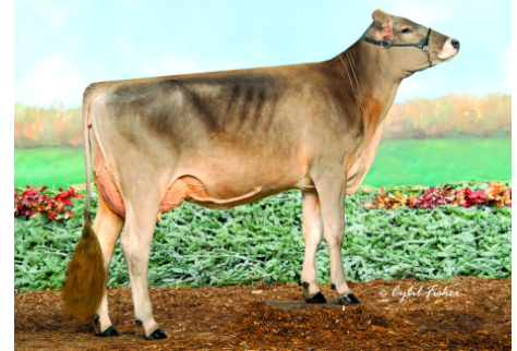
V B HP NORWIN TEANNA ET '2E 90' Reserve All American Yearling in Milk 2018 MGD OF 709BS2 FULL THROTTLE