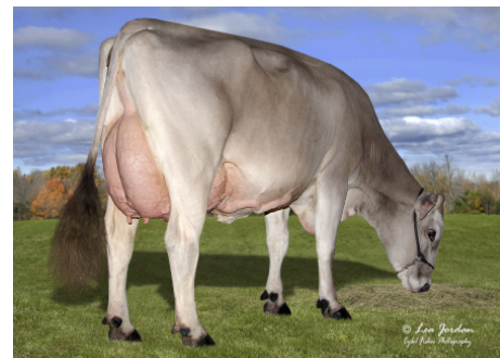
Red Brae Pactole Nicki ETV 'E 90 E 91 MS' DAM OF 709BS22 RUMCHATA

Genomic Gems, Preferred Sex VANILLA X PACTOLE X RICHARD