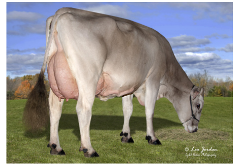
Red Brae Pactole Nicki ETV 'E 90 E 91 MS' DAM OF 709BS22 RUMCHATA

Sire: AG Vanilla Dam: Red Brae Pactole Nicki ETV 'E 90 E 91 MS' 2-00 365d 3x 31,120 4.7 1,416 3.7 1,116 MGS: Pactole MGD: Red Brae Spa Richard Nicole 'E 91 E 90 MS' 6-02 365d 2x 28,340 4.7 1,341 3.7 1,043 Lifetime: 1,973d 132020m 6,371f 4,965p