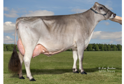
Red Brae Spa Richard Nicole 'E 91 E 90 MS' GRAND DAM OF 709BS22 RUMCHATA