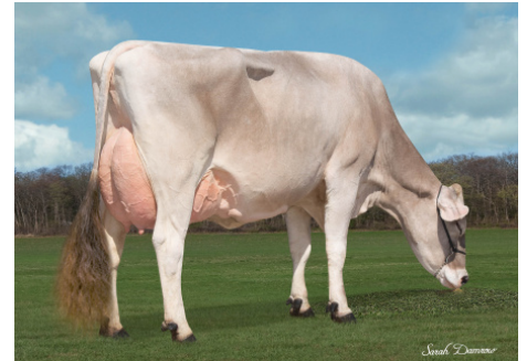
Hilltop Acres Bose Dixiland Et '3E 93 E 93 MS' MGD OF 709BS3 DARK HORSE