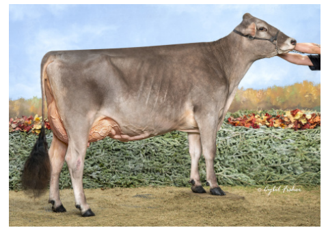
HILLTOP ACRES H DAMARA 'E 91 E 91 MS' DAM OF 709BS3 DARK HORSE ALL AMERICAN SR. 3 YEAR OLD 2025 1ST SR 3 YR OLD & HM INTERMEDIATE CHAMPION WORLD DAIRY EXPO 2025

Sire: HF DESIGN ET Dam: Hilltop Acres H Damara ETV 'E 91 E 91 MS' 2-01 305d 3x 24,020 4.0 967 3.5 851 MGS: Goldhill Bender Huge SG ET MGD: Hilltop Acres Bose Dixiland '3E 93 E 93 MS' Lifetime: 2,543d 275,410m 14,359f 10,089p Dam of 54BS558 DAREDEVIL