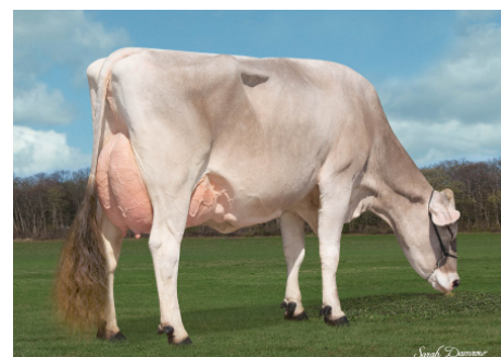
Hilltop Acres Bose Dixiland Et '3E 93 E 93 MS' MGD OF 709BS3 DARK HORSE