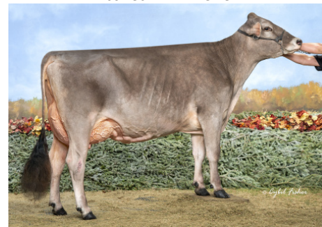
HILLTOP ACRES H DAMARA 'E 91 E 91 MS' DAM OF 709BS3 DARK HORSE ALL AMERICAN SR. 3 YEAR OLD 2025 1ST SR 3 YR OLD & HM INTERMEDIATE CHAMPION WORLD DAIRY EXPO 2025