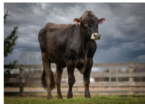
709BS3 DARK HORSE