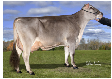
Hilltop Acres J Naomi 'V 87 V 88 MS' DAM OF 709BS4 NIGHTCAP 2ND LACT.

Sire: Perry Brook P Crazy Horse ETV Dam: Hilltop Acres J Naomi ET 'V 87 V 88 MS' 1-11 365d 3x 33,140 4.7 1,570 3.9 1,309 MGS: Portmann BS Bays Jonmar MGD: Hilltop Acres S Nutella '2E 92 E 92 MS' 2-08 365d 3x 39,060 4.9 1,902 4.0 1,575 3-11 365d 3x 41,530 5.1 2,103 3.9 1,602