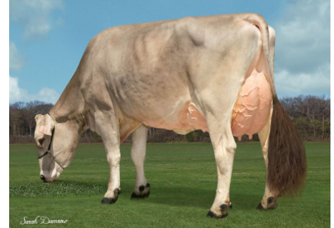
Hilltop Acres S Nutella '2E 92 E 92 MS' MGD of 709BS4 NIGHTCAP 3rd Lactation