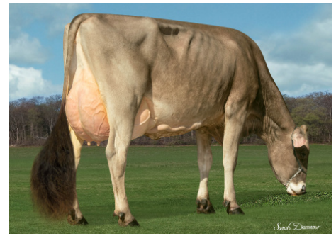
Hilltop Acres Pac Taelyn ETV 'E 90 V 89 MS' DAM OF 709BS6 TOPSHOT

Sire: Hilltop Acres Nashville ET *TM Dam: Hilltop Acres Pac Taelyn ETV 'E 90 V 89 MS' 1-09 362d 3x 35,220 4.3 1,517 3.5 1,220 2-11 344d 3x 39,170 4.5 1,746 3.5 1,368 MGS: Pactole MGD: Hilltop Acres DB Tabby ETV '2E 91 E 91 MS' 3-05 365d 3x 40,090 5.0 2,015 3.7 1,500 4-09 365d 3x 39,910 4.9 1,966 3.7 1,476