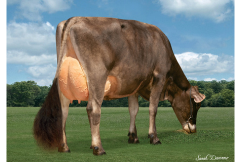
Hilltop Acres DB Tabby ETV '2E 91 E 91 MS' MGD OF 709BS6 TOPSHOT & 54BS628 TOP NOTCH