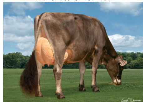
Hilltop Acres DB Tabby ETV '2E 91 E 91 MS' MGD OF 709BS7 TOP THAT