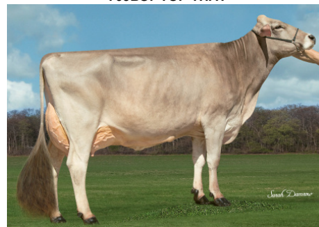
Hilltop Acres Kingsley Tammie 'E 92 E 94 MS' DAM OF 709BS7 TOP THAT